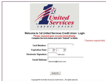
(b) Phishing attempt - Level 2