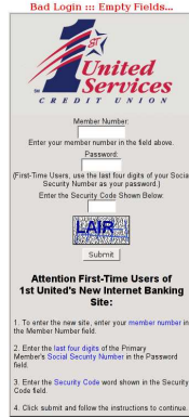
(a) Legitimate web page

negative rate (FNR) equal to 7.4%. We verified, by visual inspection, that those two positive pairs were indeed difficult to detect by our visual-similarity-based approach. Figure 1 shows screenshots of one of the two undetected pairs; note that both the overall appearance and textual contents of the pages are significantly different.